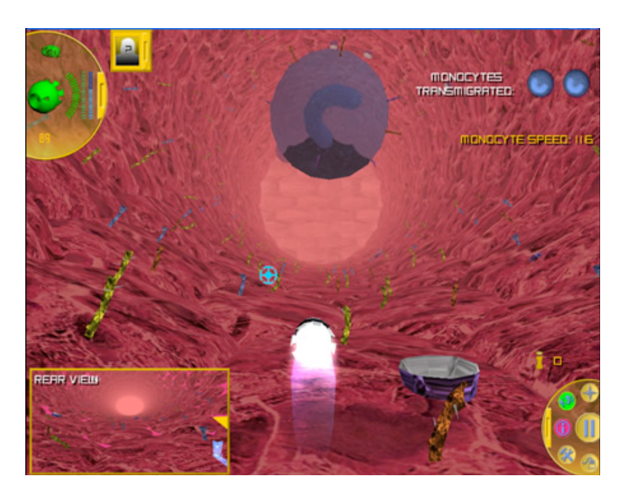
Figure 1. Immune Attack Interface.

to complete a survey of demographic information survey (Appendix A) as well as an immunology pretest (Appendix B). The participant demographic information survey captured information such as age, self-reported video game experience, and perceived video game expertise.